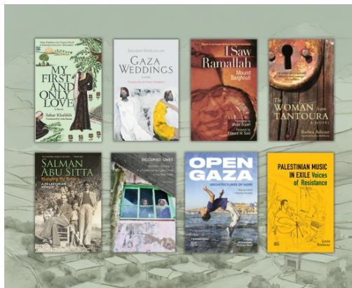
Recommended Books on Palestine